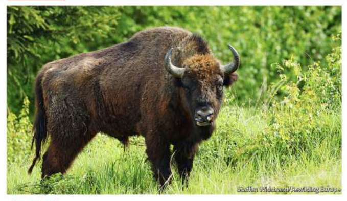
Butting back An ancient beast returns to Transylvania

Environmentalists in Romania are bringing back the European bison