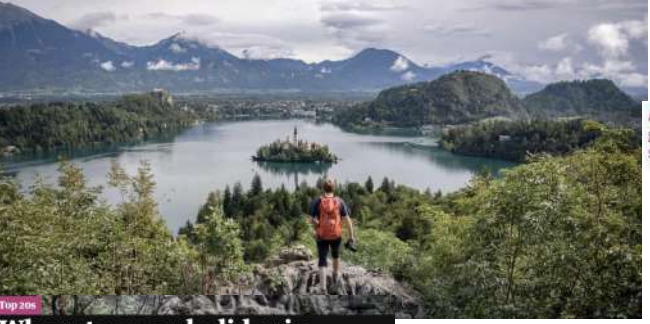
Where to go on holiday in 2020: the alternative hotlist

www.economist.com/europe/2019/08/22/an-ancient-beast-returns-to-transylvania